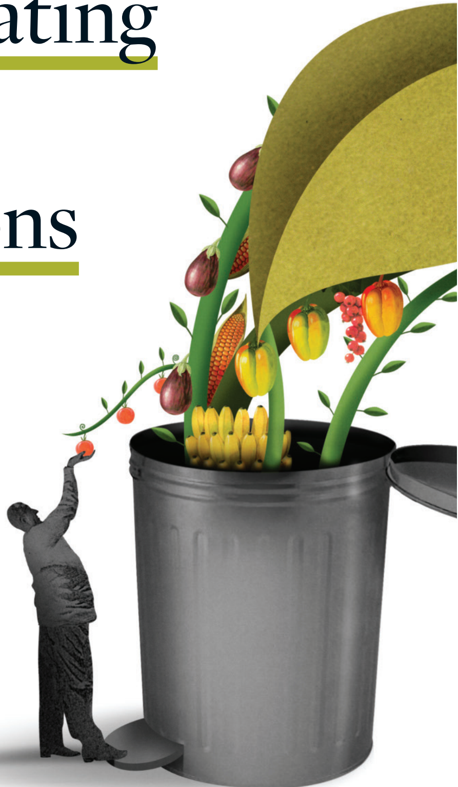
Illustration by Brett Ryder